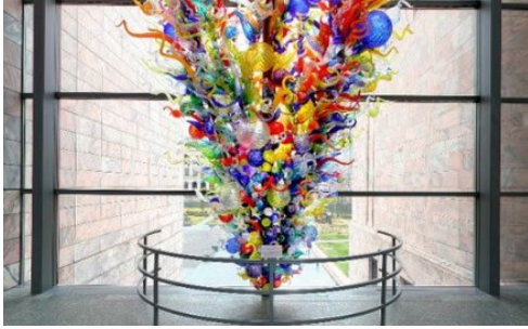
Chihuly Glass at the Joslyn Art Museum;