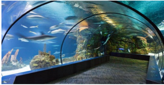
Henry Doorly Zoo & Aquarium