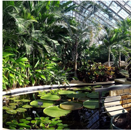
Lauritzen Gardens Botanical Center