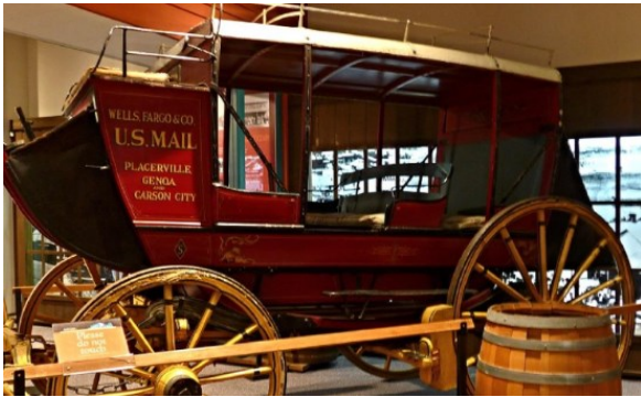
Durham Museum Stage Coach