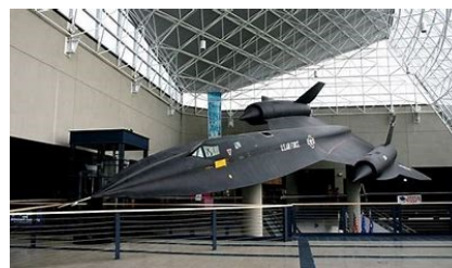
Blackbird Airplane Exhibit

Well, I hope this inspires you to make the pilgrimage to Omaha; you won't be disappointed! See the next page for photos of interesting areas in Omaha.